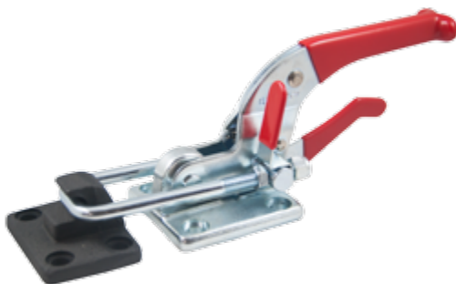
GH-40370-LP (Sold Separately) GH-40370-R