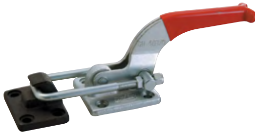
GH-40370-LP (Sold Separately) GH-40370

Both the alloy steel base and the optional latch plate are forged for strength and durability.